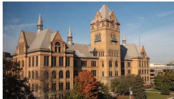
One of the world's most comprehensive rankings of academic quality has classified Wayne State University as 67th in the United States and 225th worldwide.